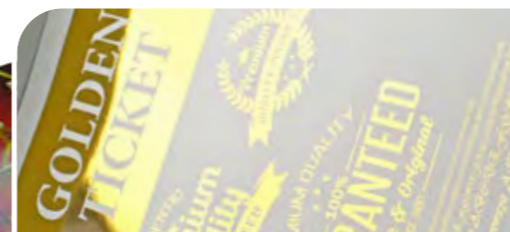
Metallic spot foil flaring - choice of finishes - makes your print ooze premium quality

Premium finish flaring assembly This 'accessory' now ships as standard with the CF1200L and LX models and is easily installed within moments. It is utilised when a superior mirror finish foil is desired. The super-soft surface of the roller gently smooths the foil into a perfectly flat condition, just at the point of application.