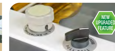
The new pull roll control, enables improved foil flaring results by allowing the user to disengage the lamination pull roller when performing foil flaring