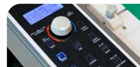
Easy-to-use touch panel provides instant digital control, including sheet size, speed and temperature for laminates and flaring / decorative effect films