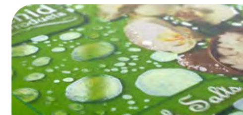
Create the 'WOW' effect with high gloss lamination to make your print 'sing'