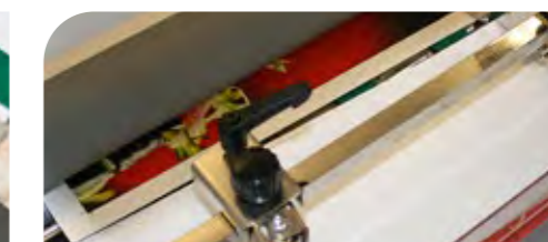
Automatic burst separating system separates sheets and delivers a clean datum edge from which to easily cut or guillotine

Premium decorative effects for digital solutions