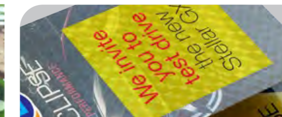
Carbon fibre holographic lamination adds a touch of mechanical techno-class

which enables subsequent overprinting through digital devices. This provides the opportunity to further enhance printed materials with additional decorative effects when using a combination of lamination and foil flaring. No ordinary laminating device can achieve anything like these unique and superb results!