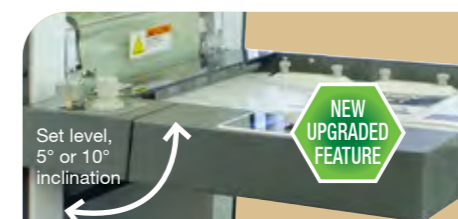
The new inclined feed table can be set level, or at 5° or 10° to aid semi-automatic feeding, which helps to increase productivity

Premium effects gain premium profits The flexibility to create and control stunning effects from just one compact device will lift ordinary print work to the level of extra-ordinary – and offers an even greater return on investment.