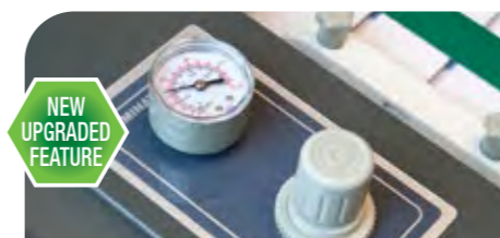
Even more pneumatic pressure with CF1200 models, offering wider choice of media for stunning metallic foil flaring results